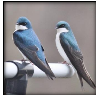
Tree Swallow ▶