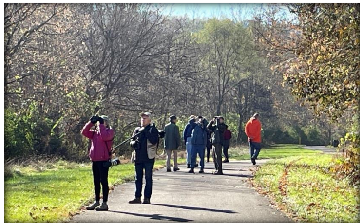
▲ Photographer: Betty Burke