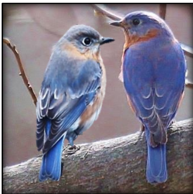
◀ Eastern Bluebird

Attracts these federally protected cavity nesters